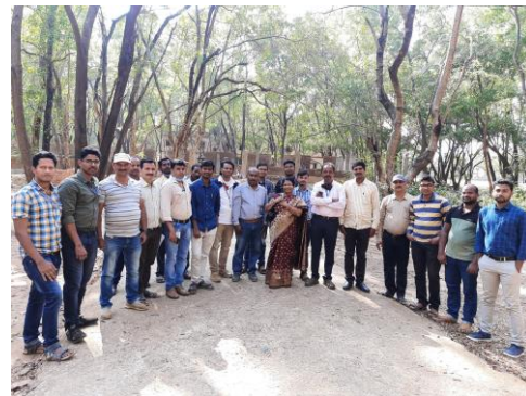
Figure 5: Walk-in interview of candidates and a group photo with recruiters.