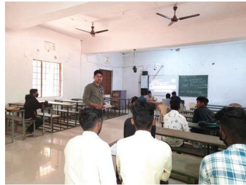
Figure 4: Verification of candidates and supporting to interviewer.