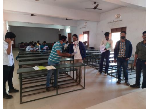
Figure 3: Registration held at Room no. 38 and helped by lecturers.