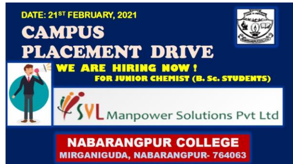
Figure 1: Digital posters are used for campus recruitment drive